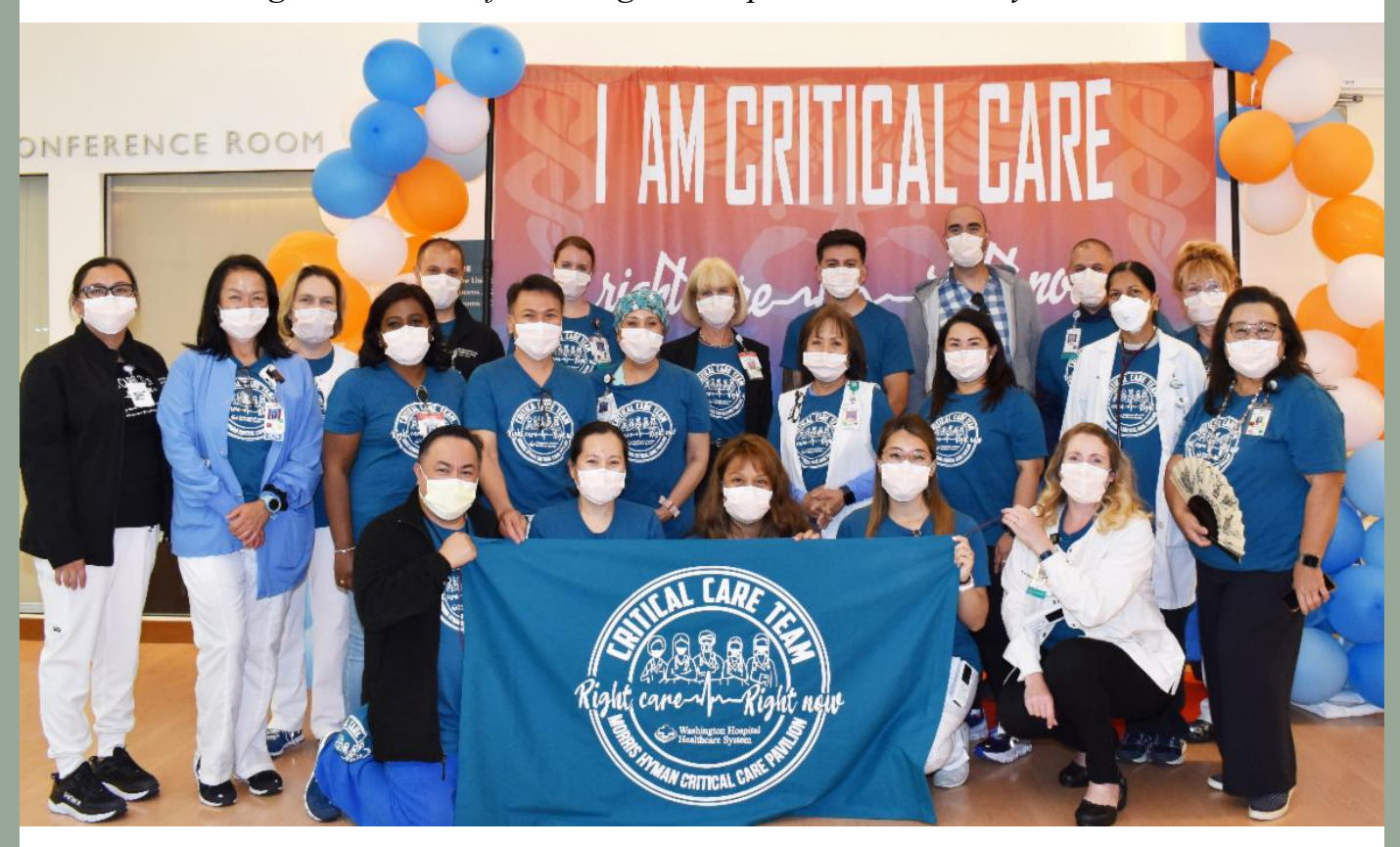
Photo : Washington Hospital's Critical Care Team celebrates Critical Care Awareness week in 2022, recognizing the commitment of critical care clinicians and staff to providing high quality patient care at Washington Hospital

Furthering the Mission of Washington Hospital Healthcare System Since 1983