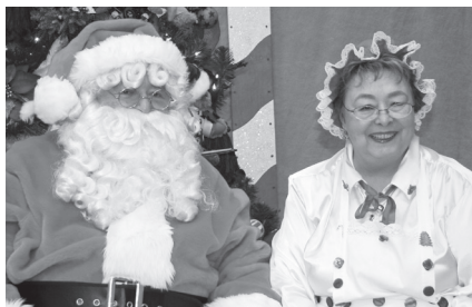
Santa & Mrs. Claus