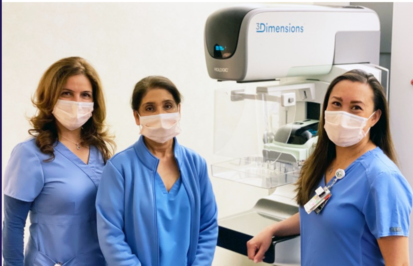
Photo: Washington Hospital's Women Center staff posing with the 3D Mammography, which is a powerful diagnostic tool for breast cancer screening that creates a 3D image from multiple scans taken at different angles.

Furthering the Mission of Washington Hospital Healthcare System since 1983